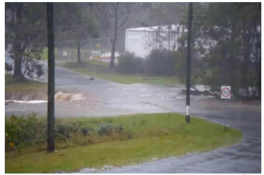
Above: Acacia Close