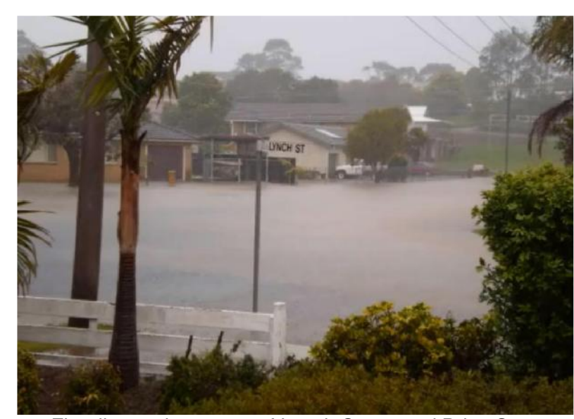
Above: Flooding at the corner of Lynch Street and Brice Street at approximately 3pm