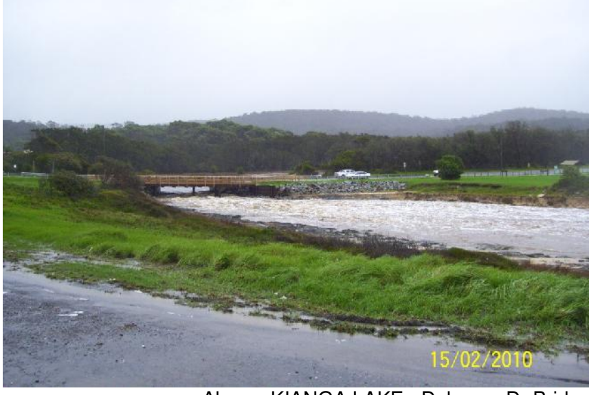
Above: KIANGA LAKE -Dalmeny Dr Bridge