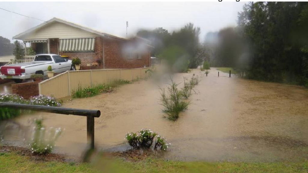
Above: Channel between Mort Avenue and Tatiara Street (upstream of Mort Avenue)