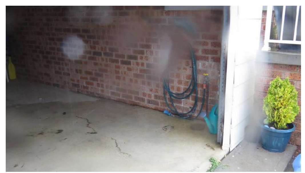
Above: Flood water inside garage on Mort Avenue