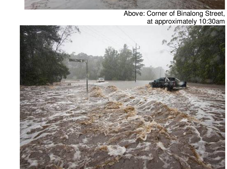
Above: Corner of Binalong Street time unknown