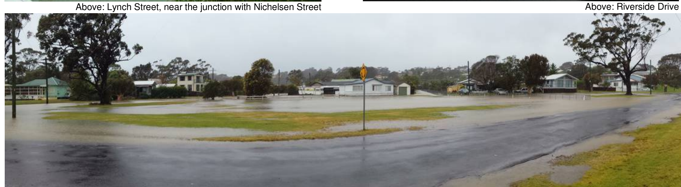
Above: Panorama at McMillian Road