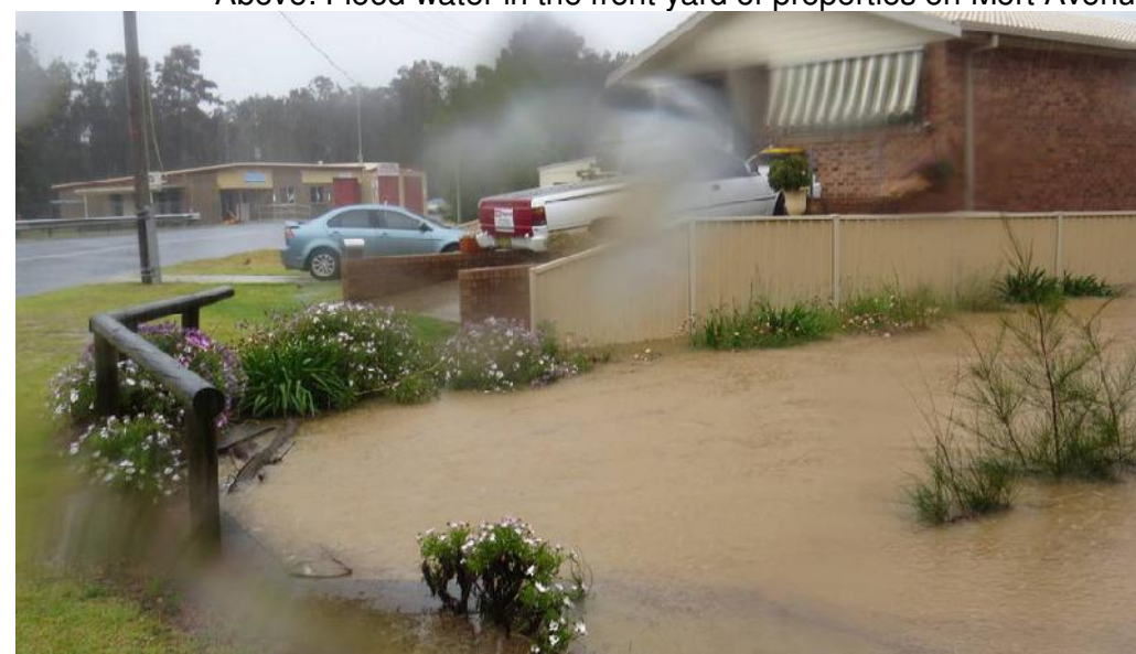
Above: Channel between Mort Avenue and Tatiara Street (upstream of Mort Avenue)