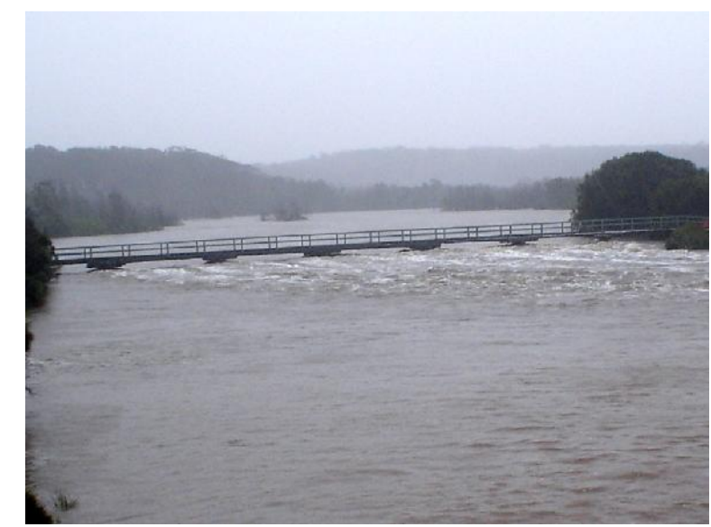
Above: Dalmeny Pedestrian Bridge, over Mummuga Lake on the16th February 2010