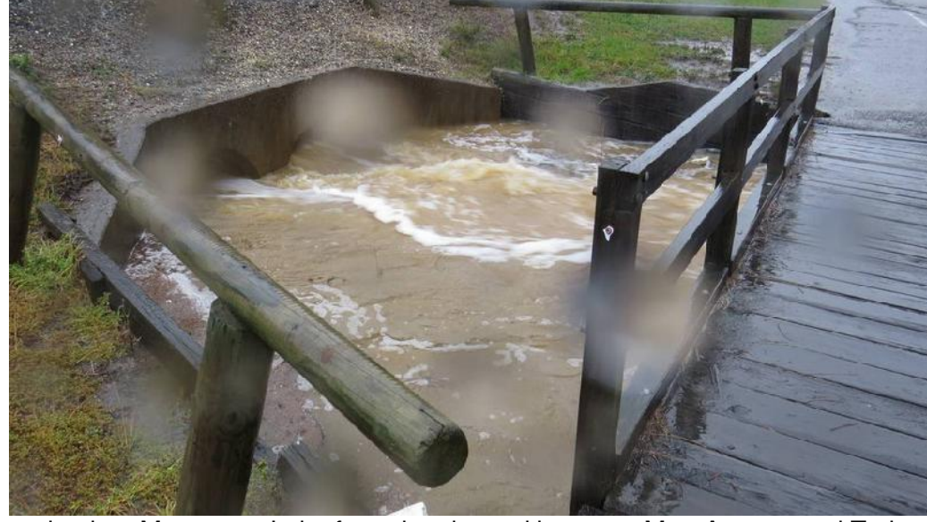
Above: White-wash from flow discharging into Mummuga Lake from the channel between Mort Avenue and Tatiara Street (downstream of Mort Avenue)