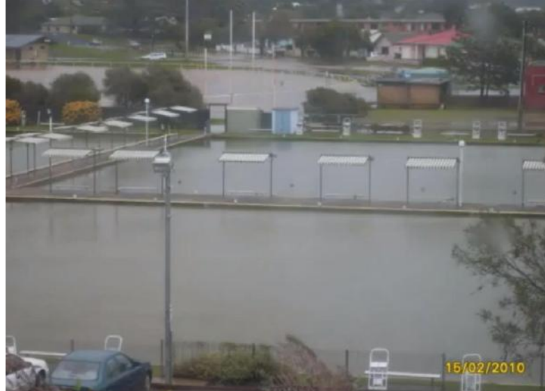
Above: Flooding of the Bowling Green and Bill Smyth Memorial Oval behind it at approximately 3pm