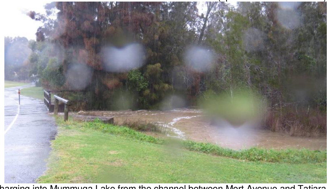
Above: White-wash from flow discharging into Mummuga Lake from the channel between Mort Avenue and Tatiara Street (downstream of Mort Avenue)