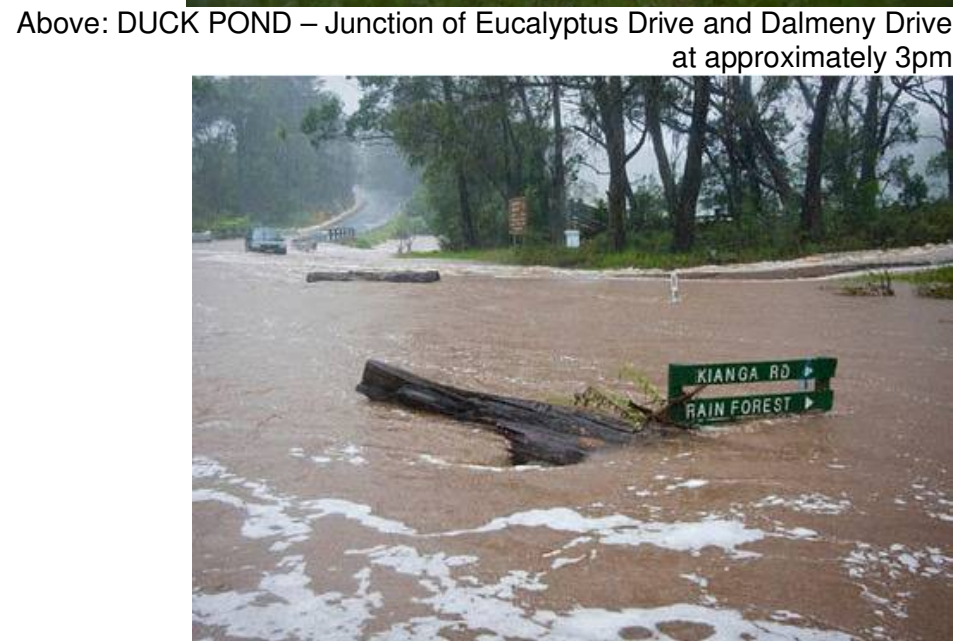
Above: KIANGA LAKE – Junction of Princes Hwy and Kianga Rd