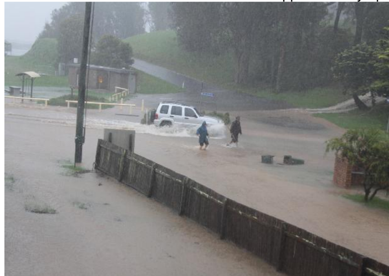
Above: Flooding on Bluewater Drive near the intersection with Bay Street