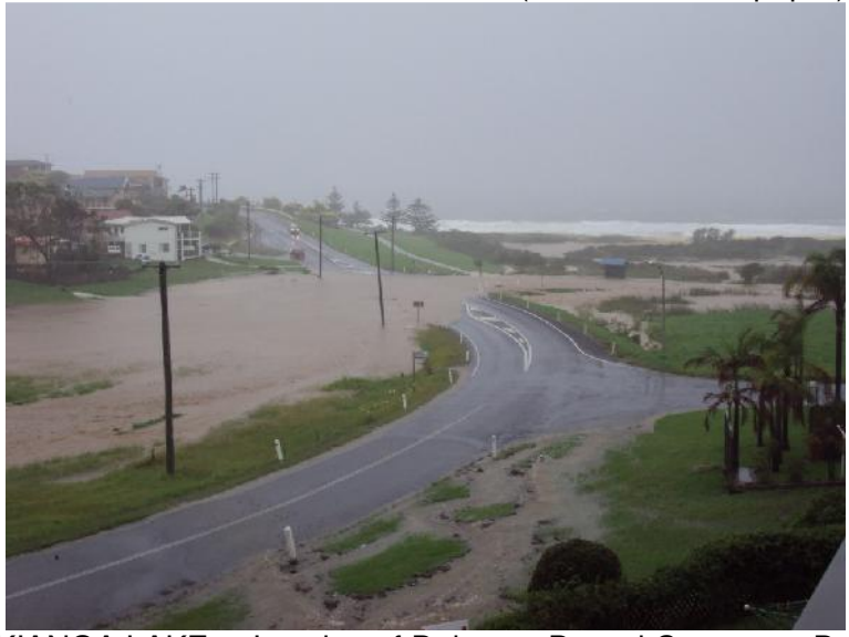
Above: KIANGA LAKE – Junction of Dalmeny Dr and Centenary Dr