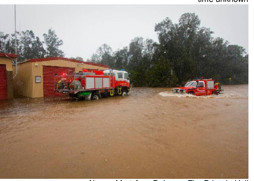
Above: Mort Ave, Dalmeny Fire Brigade Hall