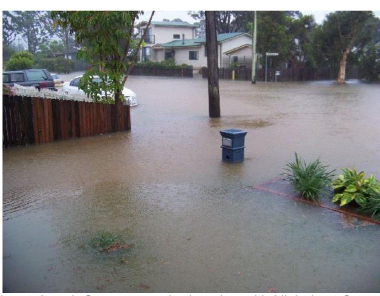
Above: Lynch Street, near the junction with Nichelsen Street