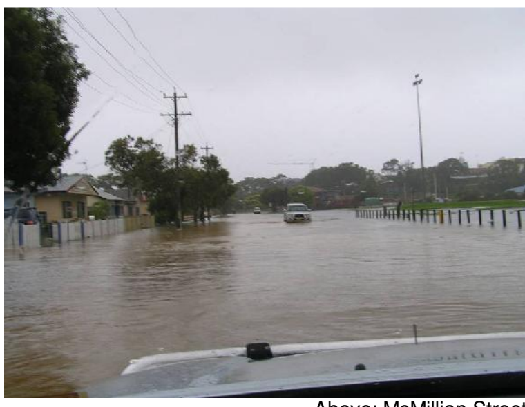
Above: McMillian Street