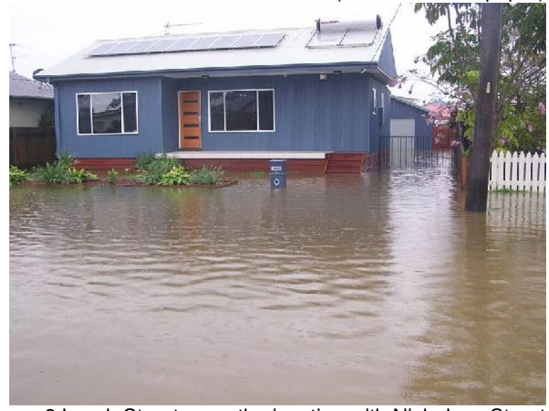
Above: 8 Lynch Street, near the junction with Nichelsen Street