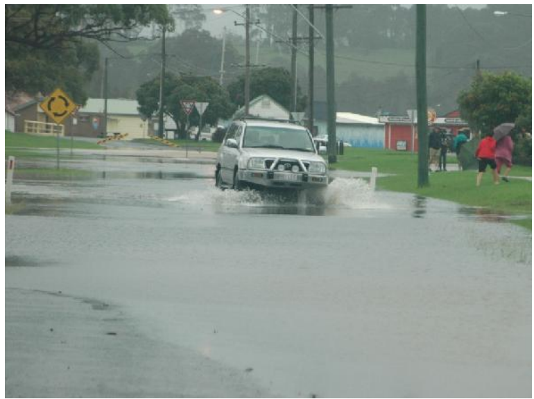
Above: Riverside Dr