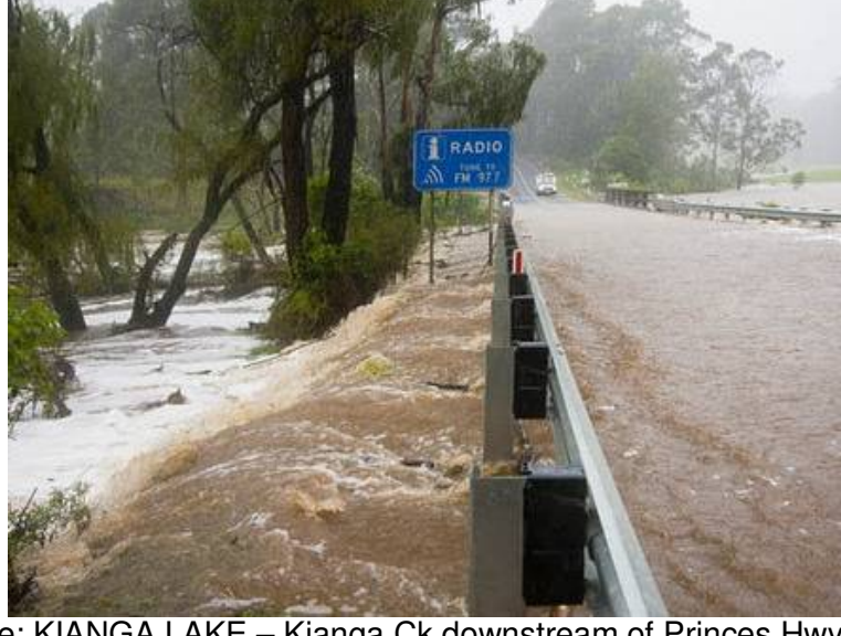
Above: KIANGA LAKE – Kianga Ck downstream of Princes Hwy (Narooma Newspaper