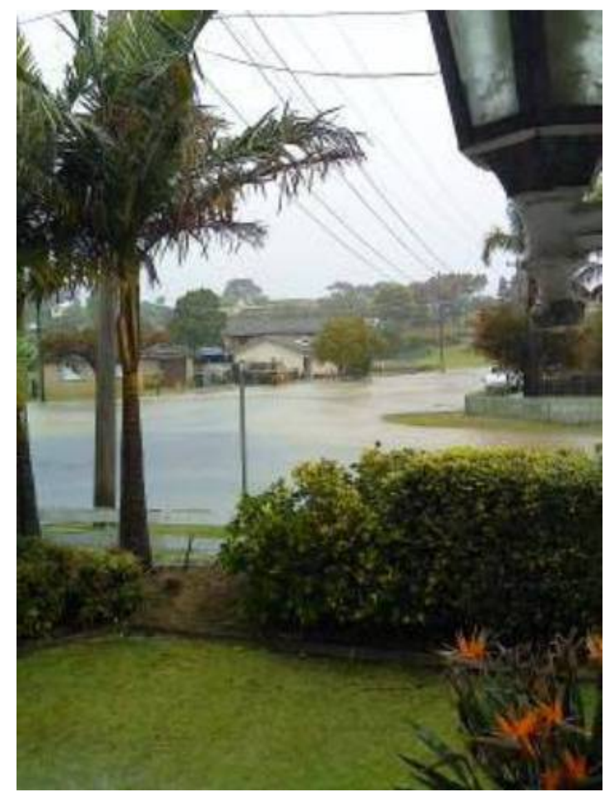
FIGURE E1D PHOTOGRAPHS OF FLOODING ON THE 14 OCTOBER 2014 WAGONGA INLET CATCHMENT