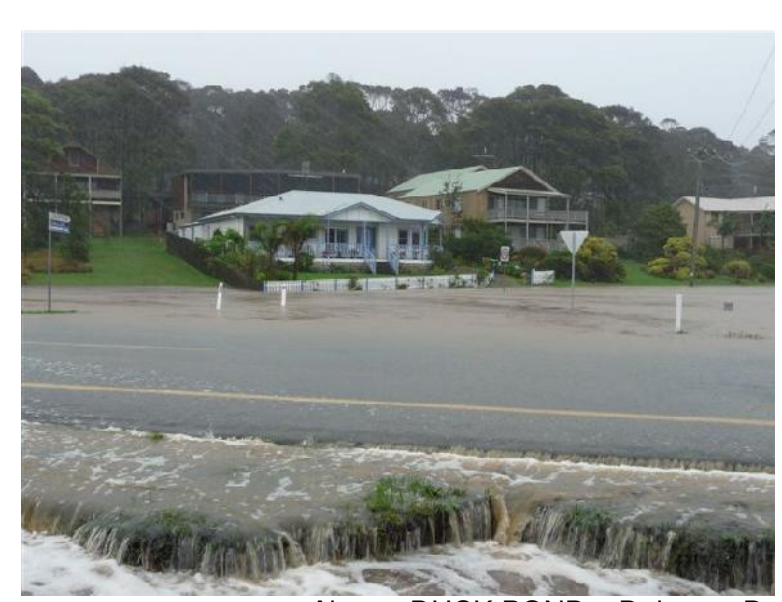
Above: DUCK POND – Dalmeny Dr