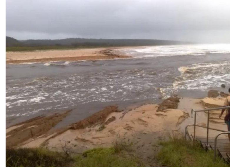
Above: Mummuga Lake ICOLL entrance was open to the ocean at the time of photo at approximately 10:30am