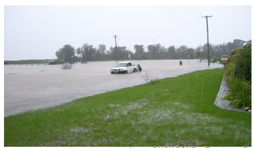
Above: DUCK POND – Eucalyptus Dr